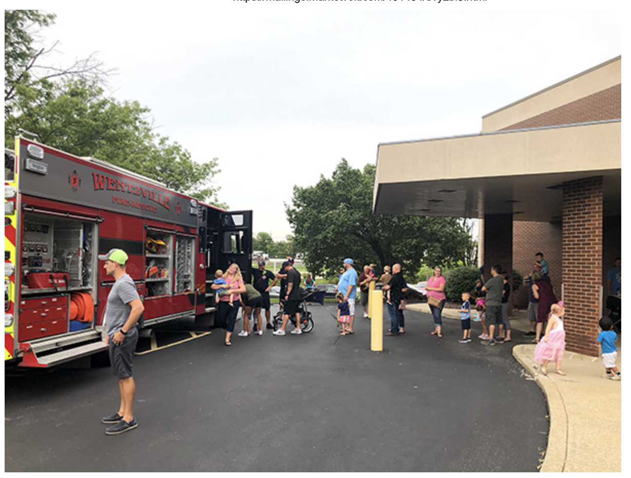
Parents as Teachers Group Connections

Parents As Teachers held their inaugural Group Connection on August 20, and it certainly turned out to be big! Over 90 families with young children came to their Big Truck Event, located at the back parking lot of the WSD Administrative Center. Thanks to our community partners there were several large vehicles from around the Wentzville community onhand for the kids: a school bus; limousine; a tractor; a dump truck; cement truck; phone bucket truck; a street cleaner; an asphalt pothole repair truck; a firetruck; and an ambulance. The children loved exploring and climbing up and into these vehicles, but the event also helped families become aware of many organizations that help our community on a daily basis. Kids love the big trucks, but these close encounters can alleviate fears of the noises they make and might even spur excitement into how the vehicles work. PAT helps serve over 1,000 young families in this fastest growing school district in the state! Learn more about them by visiting their webpage. Their next family Group Connection, with guests from the Parks Department, is September 18, at Quail Ridge Park, from 6-7 p.m.