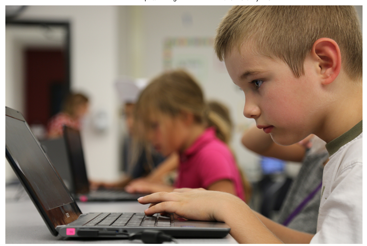
Connect with the WSD