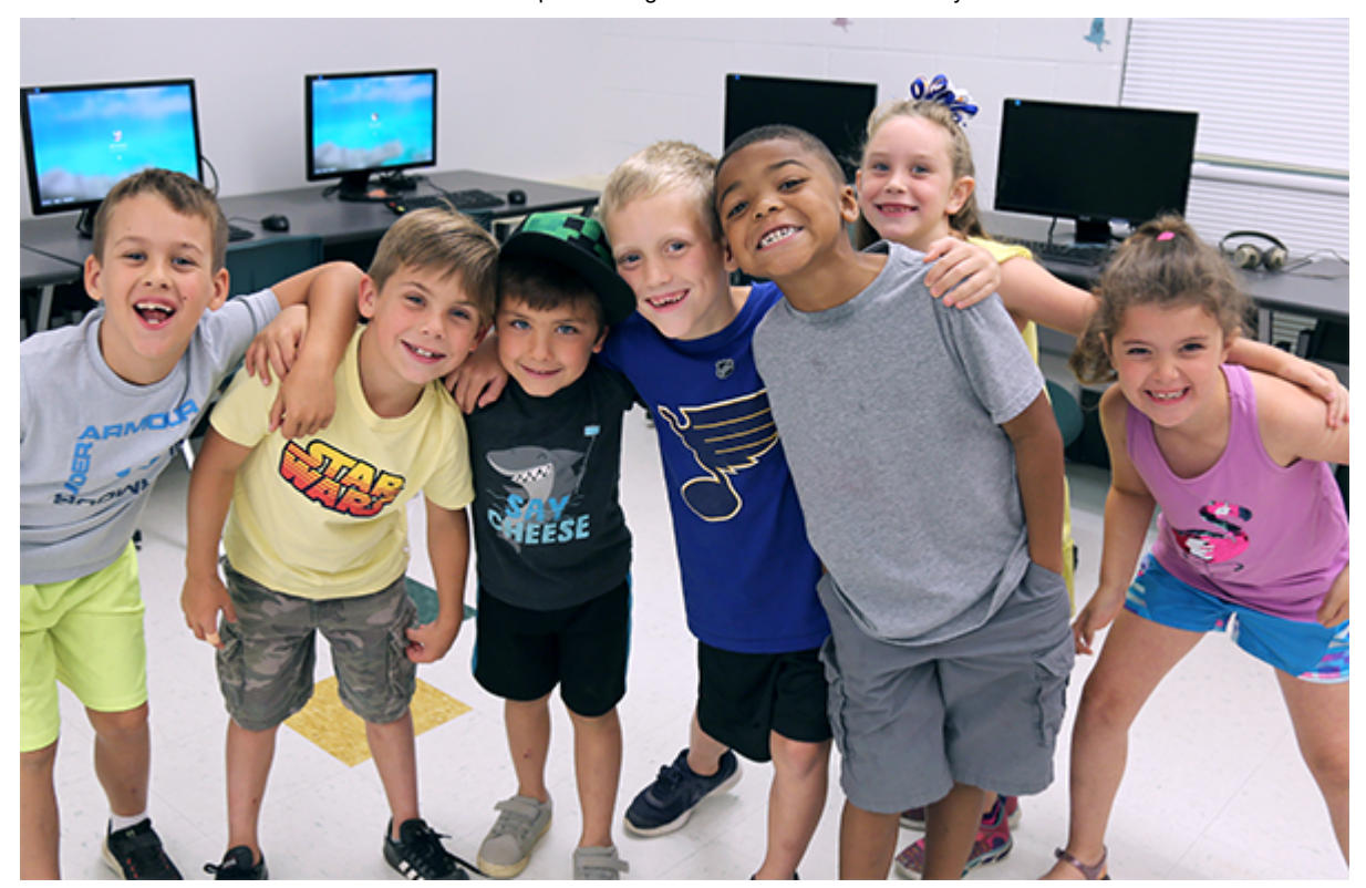
Late Start Information

The next Late Start is scheduled for Monday, September 23, 2019. The supervision for students in Grades K-6 is $10 per child for each late start day. This is separate from our Before Care Program through Chautauqua, and only for students NOT already enrolled in the Chautauqua Before School Program.