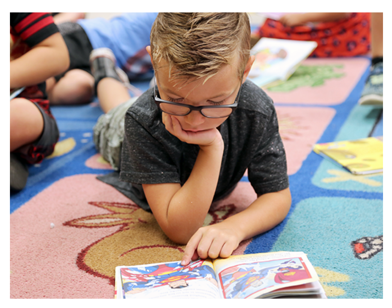
Dates to Remember

significance of the events of 9/11. Watch the video on WSD YouTube to see how WSD students, staff and the community gathered to celebrate patriotism—specifically honoring those first responders who sacrificed on that infamous day, as well as those who protect us on a daily basis, such as our military, St. Charles County Ambulance District, Air Evac Lifeteam, Wentzville Missouri Police Department, Lake Saint Louis Fire Protection District and Wentzville Fire Protection District. Thank you to all who served, and to these heroes who keep us safe every day. Read the full article on the WSD website.