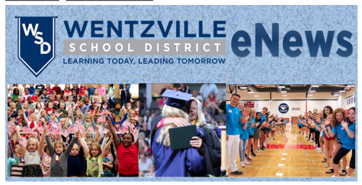
September 13, 2019

View in browser Link to forward to A friend