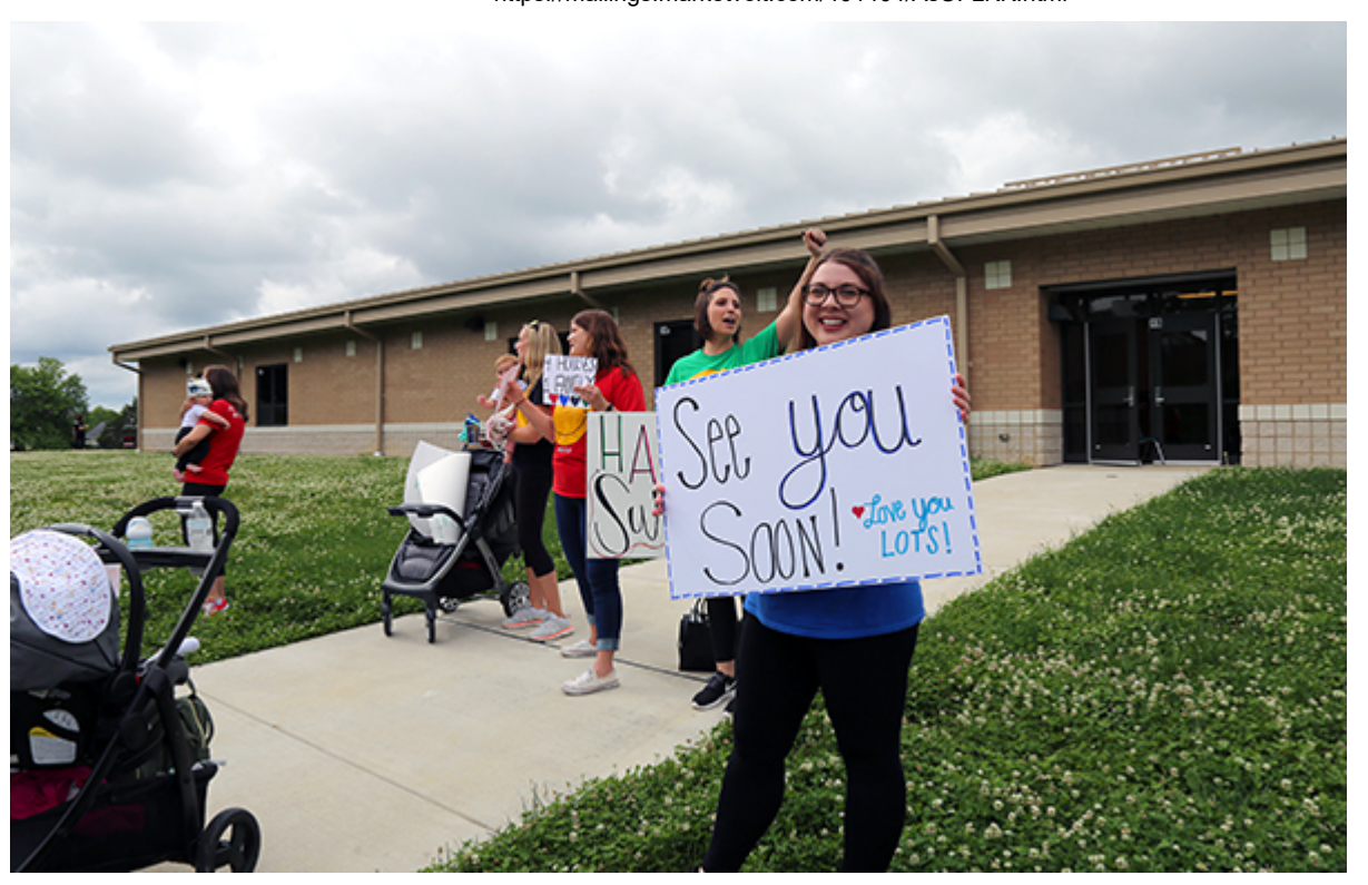
Connect with the WSD