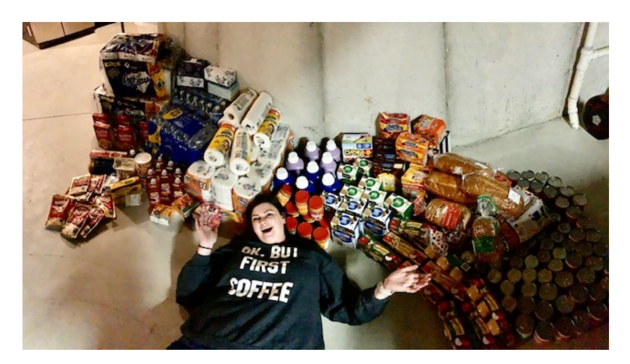
WSD Instructional Assistant Provides Food for Local Families

This year's official Doodle for Google competition theme is "I show kindness by..." and students were asked to illustrate how they would bring a little more kindness into the world. All District submissions (over 100) have been sent to Google to be judged for their international competition. Doodle for Google started in 2008 to encourage eligible U.S. school students in grades K-12 to use their creativity to produce their own interpretation of the Google logo and potentially have it featured on Google.com, as well as win some great scholarships and tech packages for their schools.