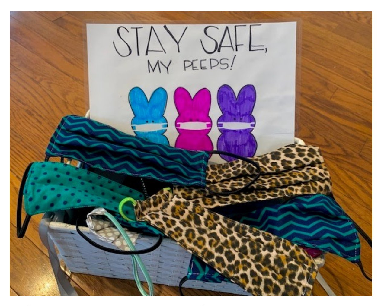
WSD Teachers Use 3D Printers and Sewing Machines to Help Protect Hospital Staff

<u>District's meal distribution</u> during the closure can be found on the District website. Any questions can be emailed to <u>info@WSDr4.org</u>.