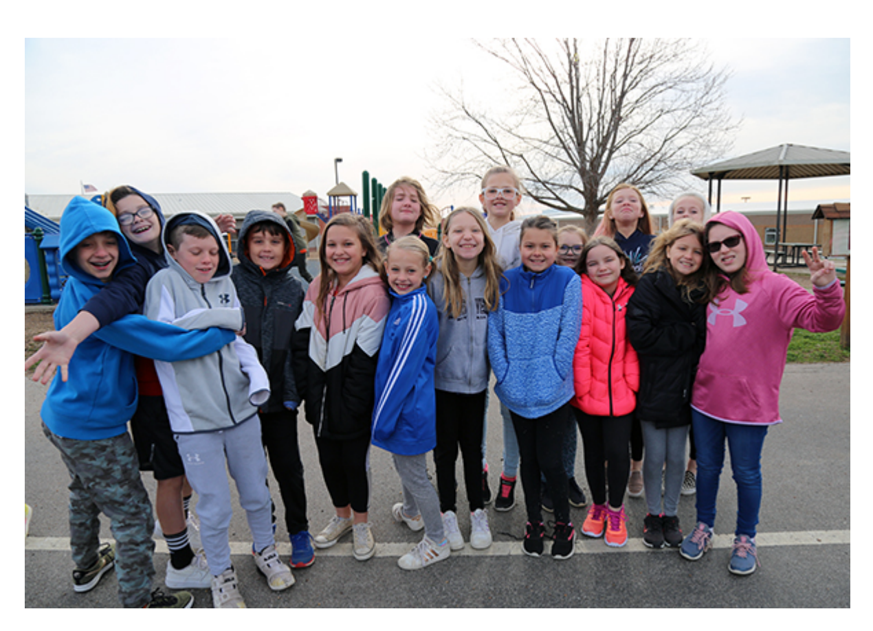
Dates to Remember

Visit the WSD website to view the new school attendance areas.