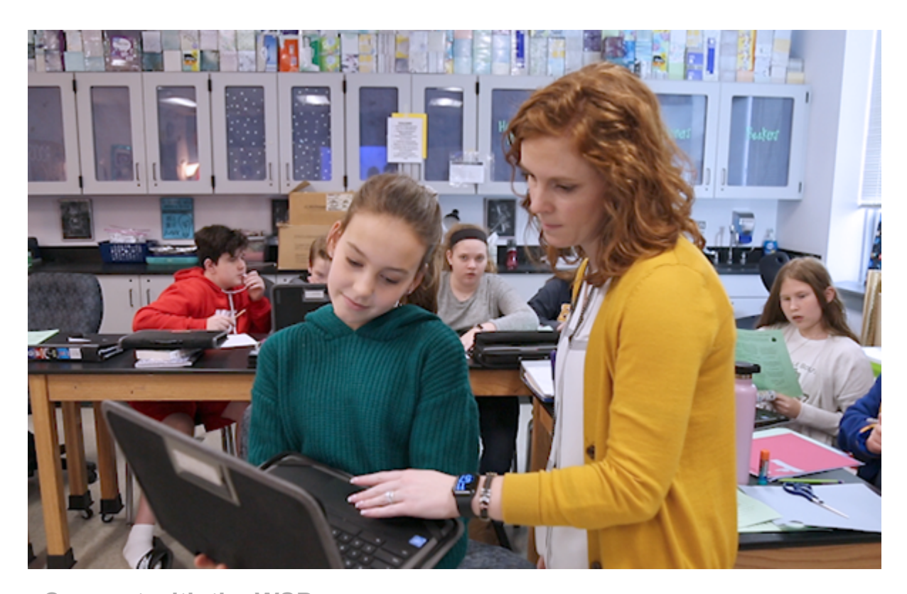
Connect with the WSD