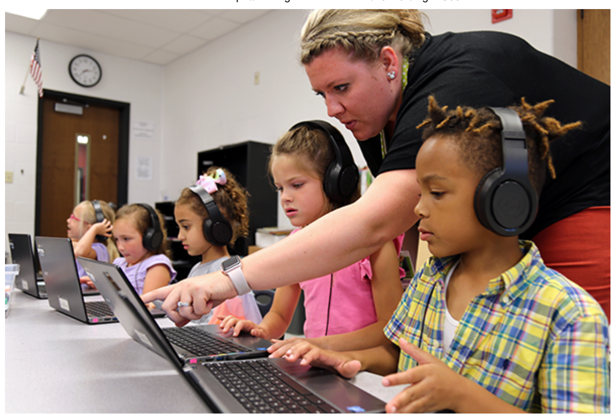
Connect with the WSD