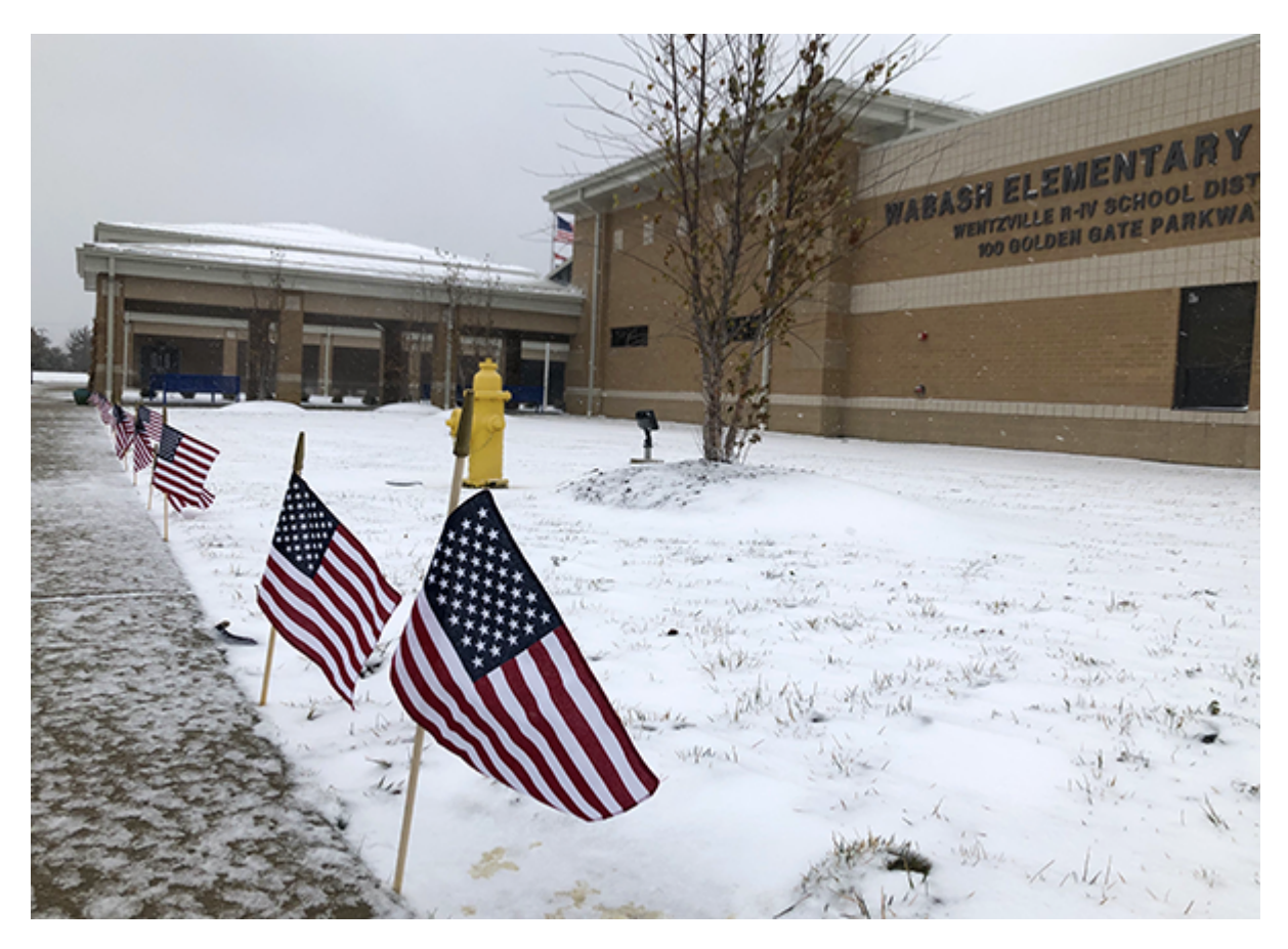
WSD Inclement Weather/School Closing Information

Late starts provide valuable collaboration time for our teachers across the District and yet we understand these days can be a challenge for working parents especially. The supervision option was established to assist those parents who need it. Additional information about late start supervision for students in Grades K-6, as well as the link to pay via PayPal can be <u>found on the District website</u>.