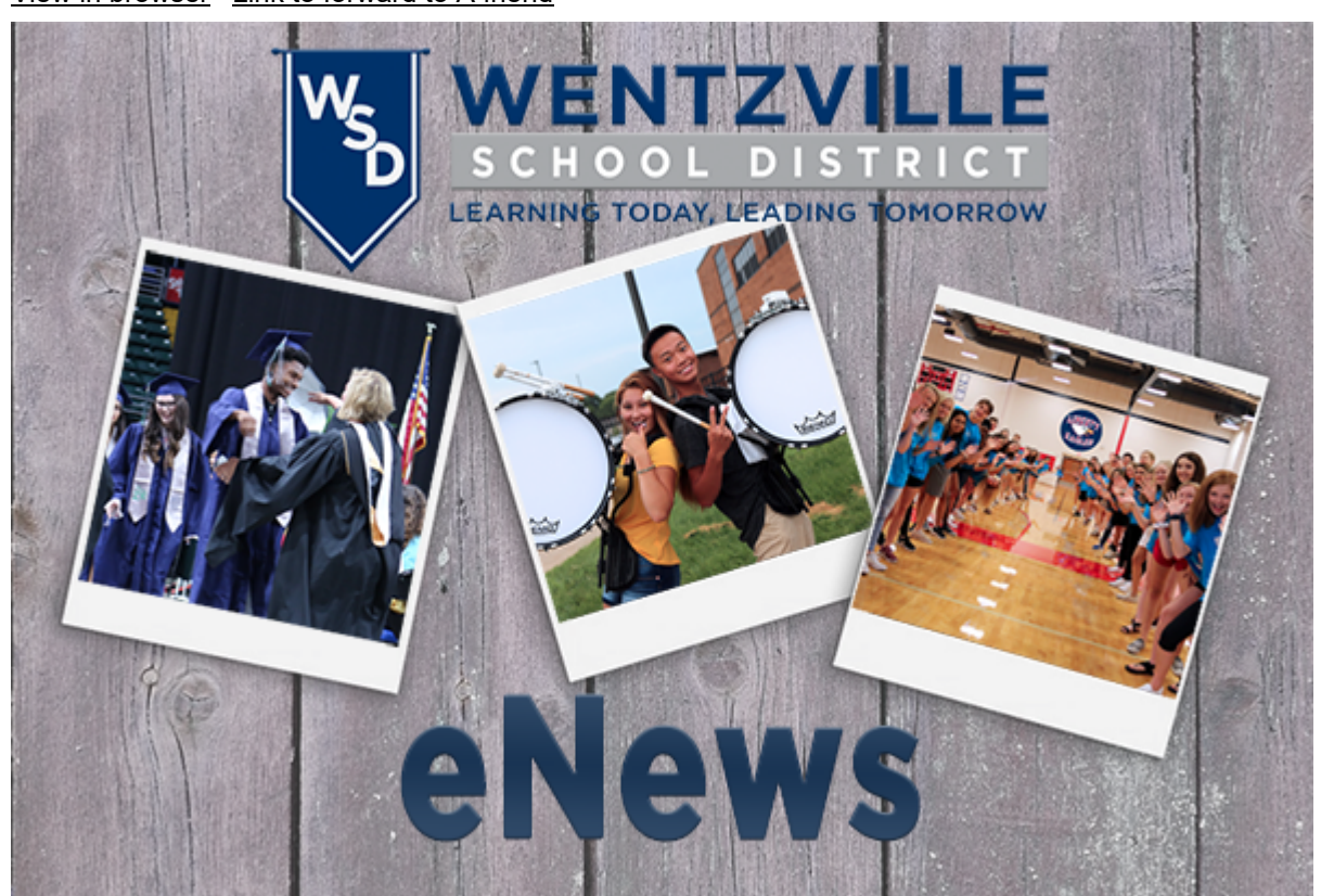
December 23, 2019

View in browser Link to forward to A friend