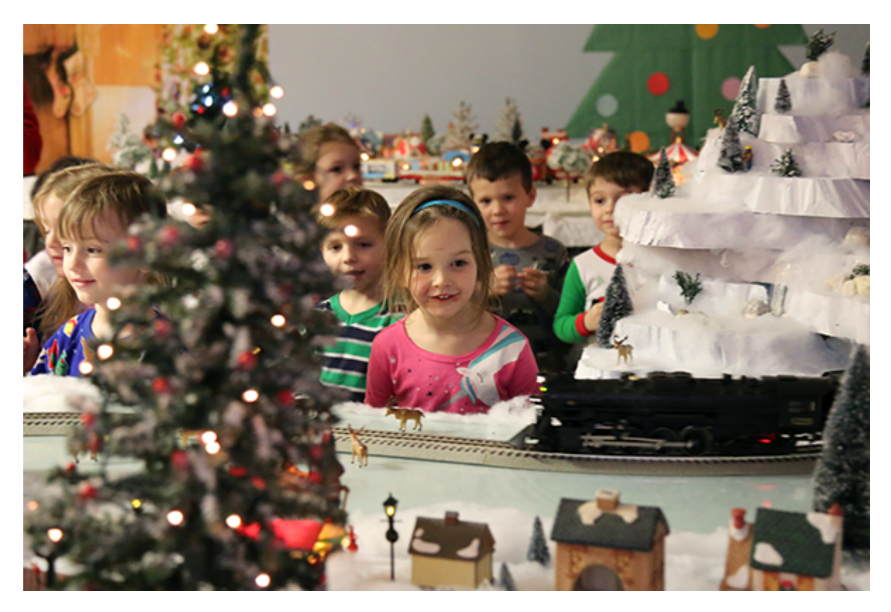
Dates to Remember

on the District website under About Our District/Board of Education.