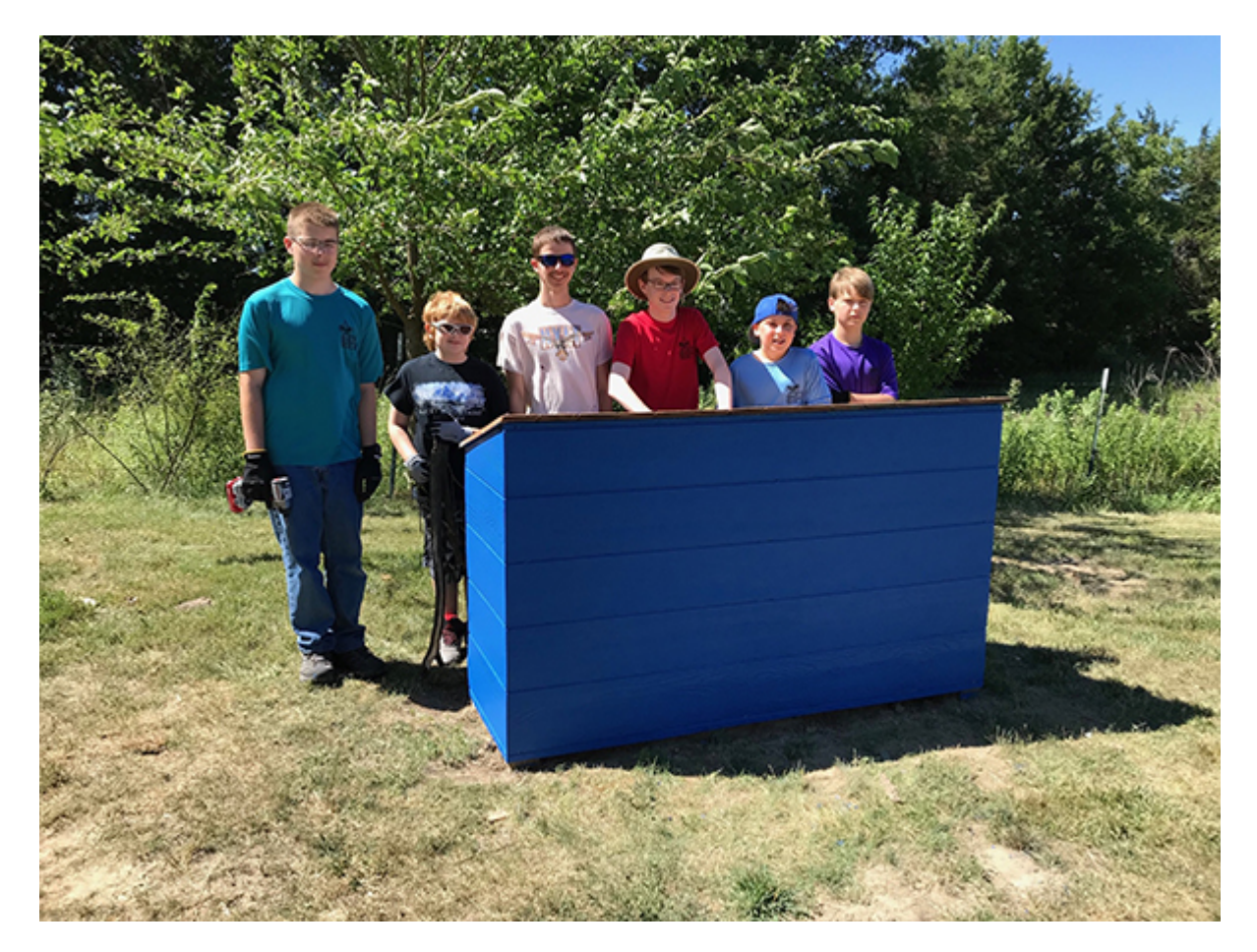
Liberty Student Performs Eagle Scout Project for Frontier Middle

Late starts provide valuable collaboration time for our teachers across the District and yet we understand these days can be a challenge for working parents especially. The supervision option was established to assist those parents who need it. Additional information about late start supervision for students in Grades K-6, as well as the link to pay via PayPal can be <u>found on the District website</u>.