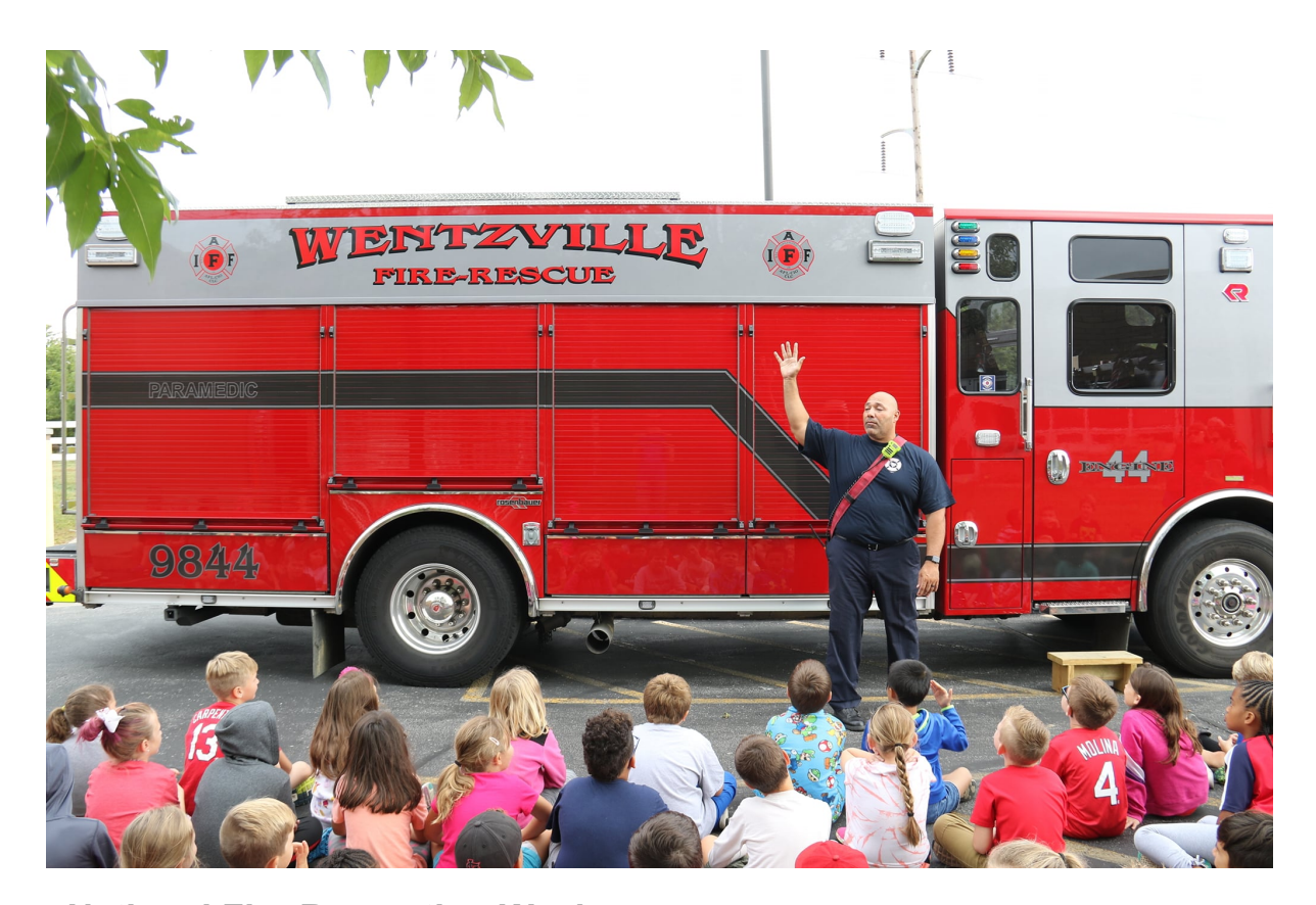
National Fire Prevention Week

ever complete. I've always liked being challenged, and working toward my Eagle is one of the greatest challenges I can undertake." #WSDproud