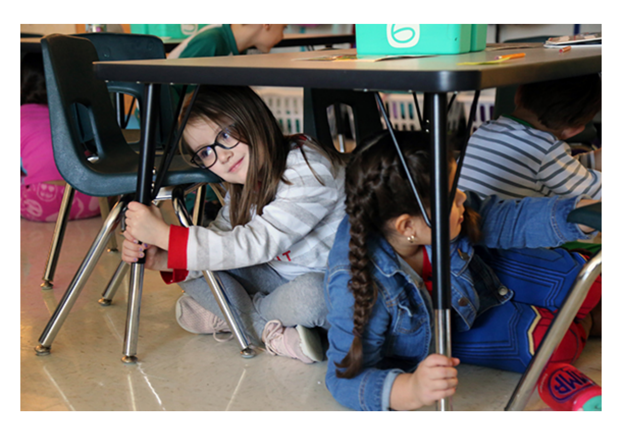
Great Shakeout 2019

when teaching about food safety to students, helping connect industry experience back to the classroom for WSD students.