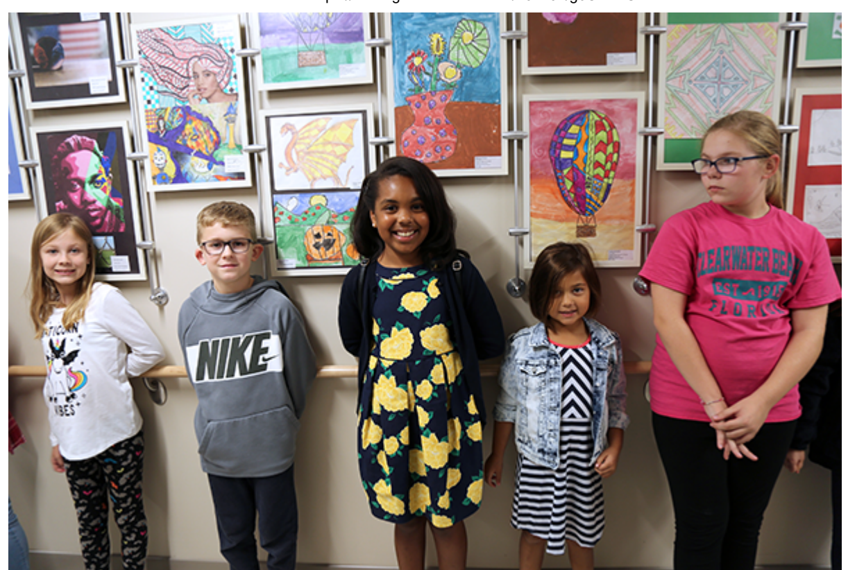
Student Art on Display at SSM Lake St. Louis

Several WSD students had artwork selected to be displayed on the SSM Health St. Joseph Hospital – Lake Saint Louis "The Art of Healing" wall, and on October 17, the hospital held a reception for the artists and their families in the emergency building. SSM Health and the WSD partnered last year to showcase student-created artwork, which rotates several times a year. The gallery includes artwork created by WSD students in kindergarten through 12th grade. Art teachers from each school selected the pieces to represent their building. Teachers also were in attendance to support these young artists, and to enjoy some refreshments and fellowship with families and hospital staff.