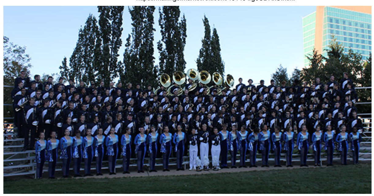
WSD Bands Compete at Marching Band Festivals

On Saturday, October 5, the Liberty Eagle Regiment took 6th place in their division at the Ozarko Marching Festival at Missouri State University in Springfield, MO. The Holt Marching Indians competed at the Blue Springs Golden Regiment Invitational in Blue Springs, MO, and placed 11th overall for the day.