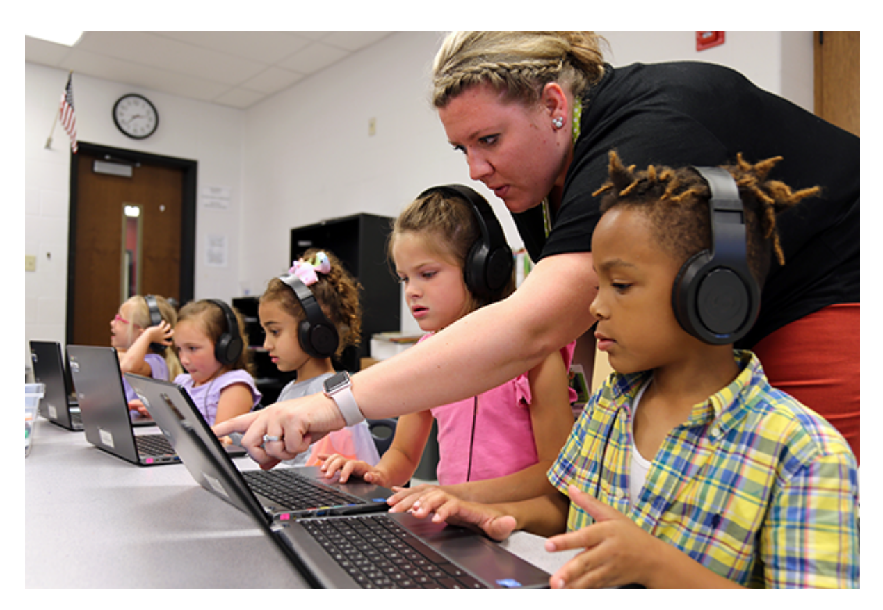
Connect with the WSD