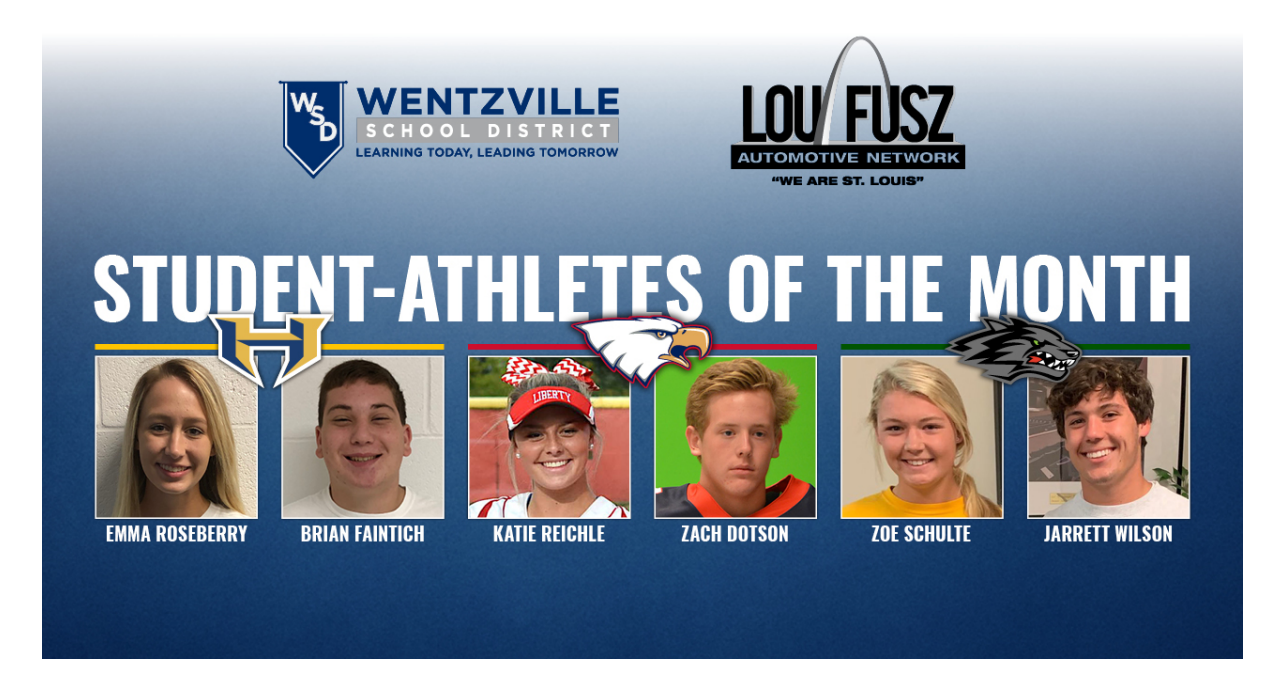
WSD/Lou Fusz Student-Athlete of the Month

The WSD/Lou Fusz Student-Athlete of the Month aims to recognize varsity student-athletes for their achievements in the classroom, commitment, sportsmanship, and teamwork. These student-athletes were honored for their performances during September 2019. For the full write-ups on these students, visit the WSD Marketing Webpage.