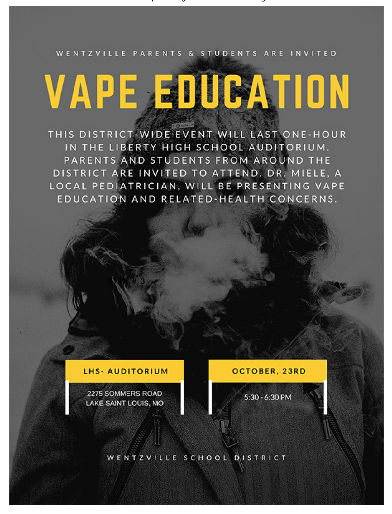
Students and Parents Can Learn More About Vaping

WSD Health Services and Northwest Pediatrics is teaming together to bring important health education information to parents and students on vaping and vaping-related health concerns. This event will take place on October 23 in the Liberty High School Auditorium from 5:30-6:30 p.m.