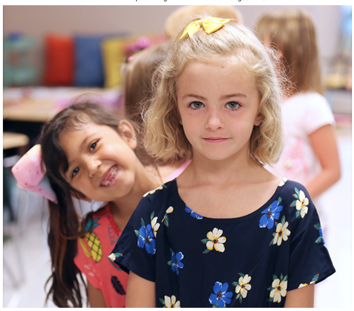
Dates to Remember