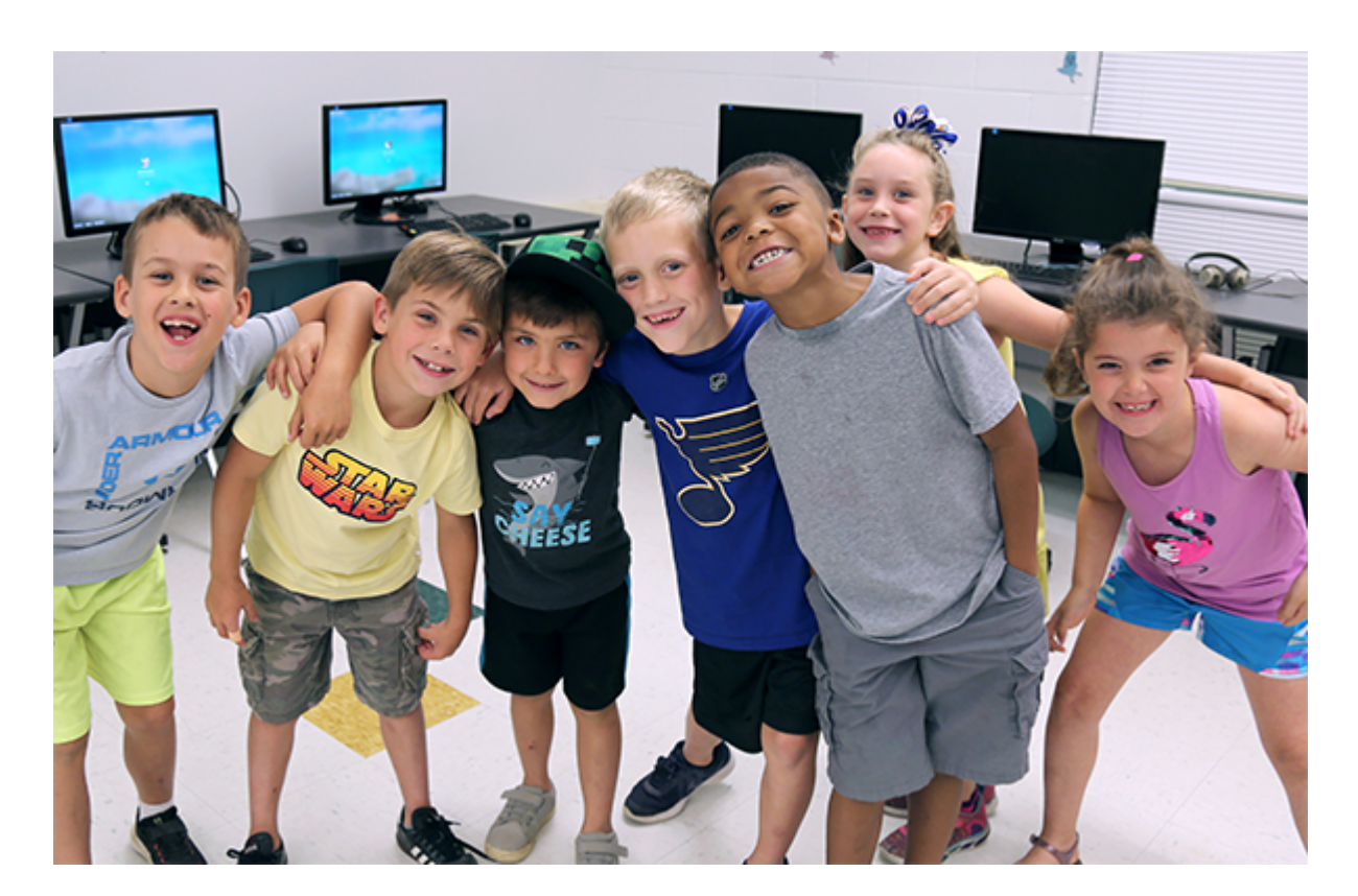
Late Start Information

The next Late Start is scheduled for Monday, October 28. The supervision for students in Grades K-6 is $10 per child for each late start day. This is separate from our Before Care Program through Chautauqua, and only for students NOT already enrolled in the Chautauqua Before School Program.